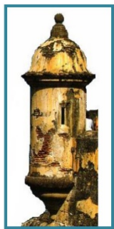
Scientific Caribbean Foundation

Scientific Caribbean Foundation Student Research Development Center