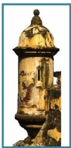
Scientific Caribbean Foundation