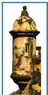
Scientific Caribbean Foundation

Scientific Caribbean Foundation Student Research Development Center