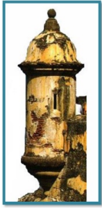
Scientific Caribbean Foundation